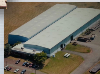
Merfish Pipe & Supply NE Kulpville, PA

In the 3 rd quarter of 2013 , Merfish Pipe & Supply acquires BBL Co, known now as Merfish Pipe & Supply NE