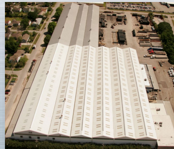
Merfish Pipe & Supply Houston, TX